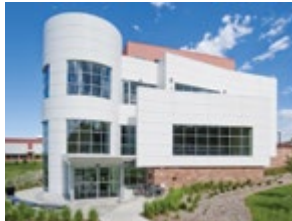
Research Innovation Center