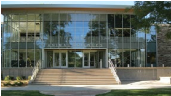
Animal Sciences Building Renovation & Addition