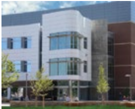
Diagnostic Medicine Center

We're looking forward to our continued commitment to the CM program, the CSU campus, and future graduates.