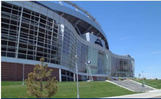
Sports | Office | Healthcare