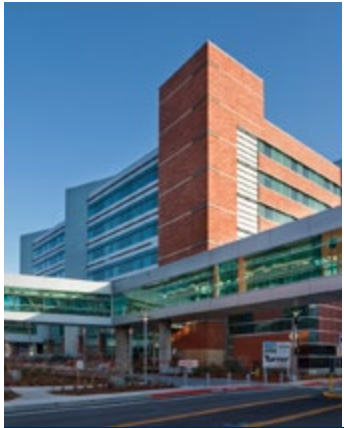
Cultural | Education | Hotels