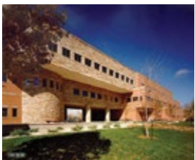
Natural & Environmental Sciences Building